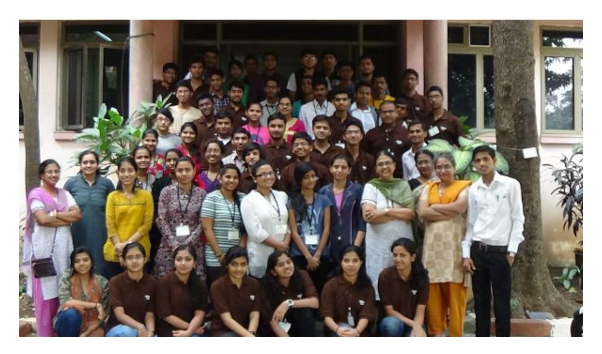
NIUS Chemistry Camp